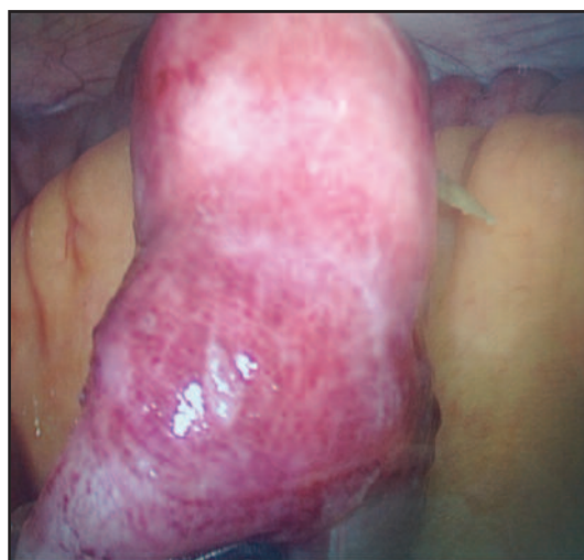
Fig. 2: Laparoscopic view of perforation with fish bone in-situ

Current guidelines state that in children and adults where a Meckel's diverticulum is detected incidentally on imaging studies, elective resection should not be performed. However as demonstrated in this case, complications may arise at any age. In a study regarding the outcomes of surgical management of Meckel's diverticulum related complications, it was shown that operative mortality and morbidity rates were 2% and 12% respectively, and that the cumulative risk of long-term postoperative complications was 7%. In contrast, the analysis of patients receiving incidental diverticulectomy showed that the operative mortality, morbidity, and risk of long-term postoperative complications were lower (1%, 2%, and 2%, respectively). It is generally recommended that Meckel's diverticulum discovered incidentally during operation should be removed, regardless of the patient's age. 5