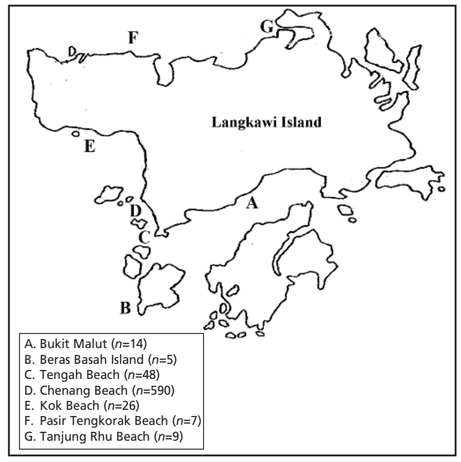
Fig. 2: Map of Langkawi Island showing the locations of the jellyfish stings.

The retrieved data were entered in a spreadsheet (Microsoft EXCEL 2007) and presented as numbers and percentages or medians and range. We also analysed the monthly numbers of patients and the locations of the jellyfish stings. The Medical Research Ethics Committee of Malaysia approved this study (NMRR-14-829-22021).