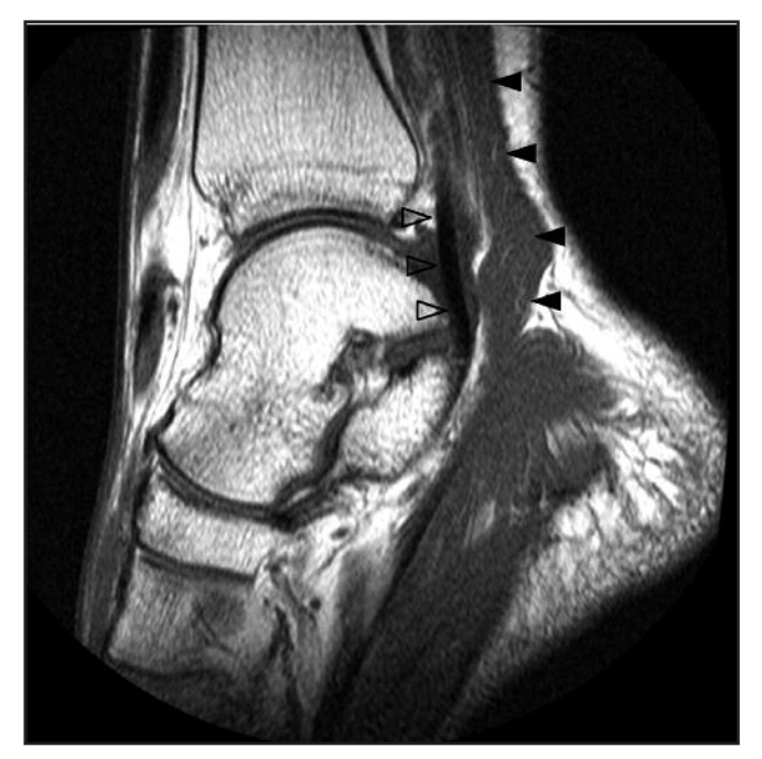
Fig. 2: Sagittal T1-weighted MR image showing the FDAL (arrow heads) remaining fleshy as it lies posterior to the flexor hallucis longus tendon (open arrow heads).

Fig. 1: Sequential cranial-to-caudal axial T1-weighted images. The FDAL (open arrow head) courses posterior to the flexor hallucis longus (FHL), abuts the neurovascular bundle (*) proximally, runs deep to the deep aponeurosis and flexor retinaculum, and inserts onto the quadratus plantae (QP). Meanwhile the fleshy accessory peroneus quartus muscle (arrow head) courses posterior to the peroneus longus and brevis (PB) tendons and inserts onto the retrotrochlear eminence of the calcaneus.