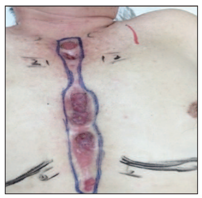
Fig. 1: Eruptions along the sternotomy wound due to overgranulation.