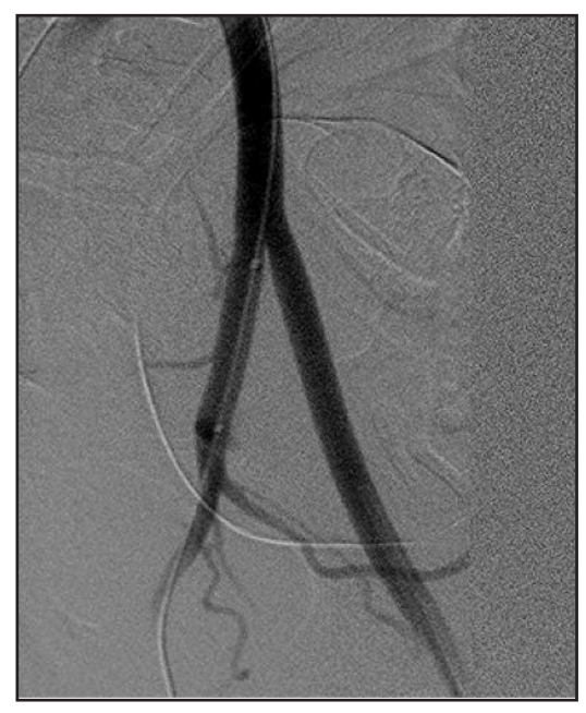
Fig. 1: Before occlusion of internal iliac artery.

Cl=confidence interval; min=minutes; mls=mililiters; SD=standard deviation