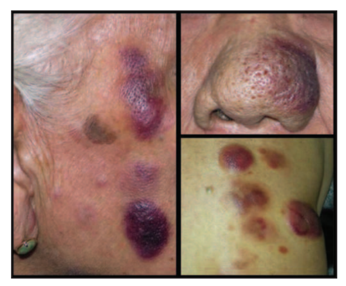
Fig. 1 : Multiple purpuric patches, nodules and plaques on the nose, right side of the face and right upper back.