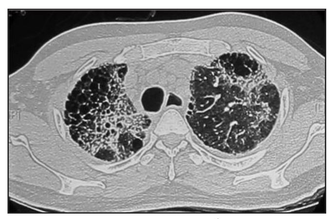
Fig. 1: Axial HRCT image showing severe fibrosis and subpleural honeycombing bilaterally.