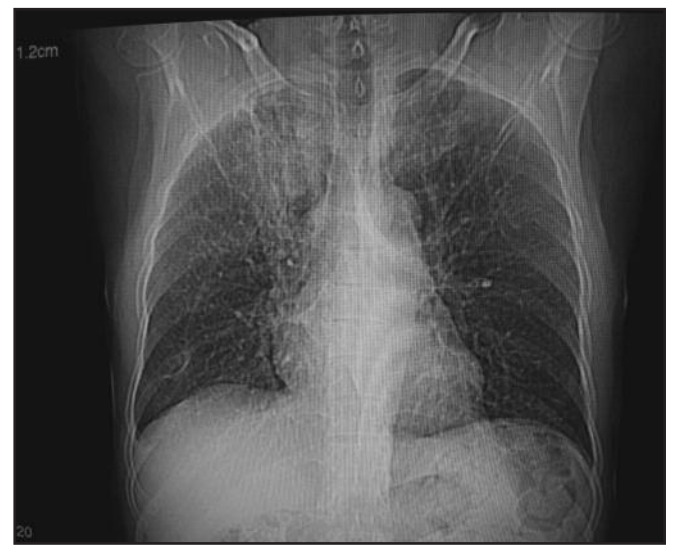
Fig. 1 : CXR - PA view showing right upper lobe nonhomogeneous opacity.