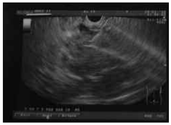
Fig. 1: Linear array endosonographic image of a large cystic mass in the head of pancreas with heterogenous solid area and FNA needle in-situ.