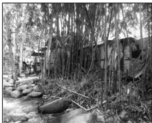
Fig. 3: One of the pit latrines (in red circle) built few meters away from river bank.

During our environmental investigation, we observed several workers were doing construction works in the park. The upgrading and renovation of drainage system and the chalets had started since early December 2009. The main contractor had employed more than 20 foreign workers since then. At present there were 26 workers but their turnover was quite fast. Some of the workers had camped inside SCRП (near the second toilet) while some staying in nearby rented house. Those camping inside SCRП claimed they used the public toilets or the river for bathing and washing.