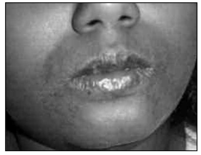
Fig. 1: Generalized blanching erythematous exfoliative maculopapular rash involving her face.