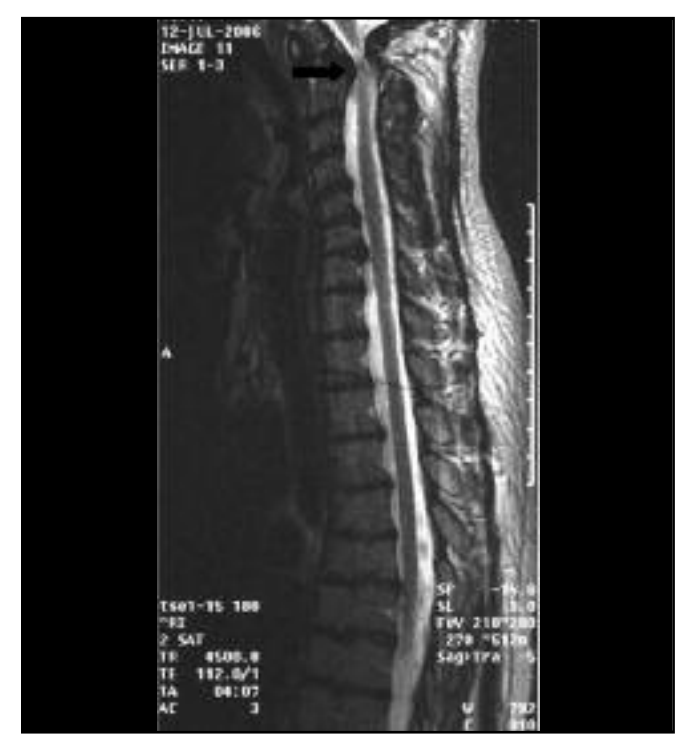
Fig. 1: T2WI of the cervical spine in sagittal, showing the dens fracture (black arrow) with posterior angulation of the fracture fragment. Significant spinal canal stenosis with resultant spinal cord compression is seen.

artery<sup>1</sup>. Incidence data is variable but it is estimated that 1.3 cases of dissection occur for every 100,000 professional spinal adjustments<sup>2</sup>. Injury was attributed to a high velocity rotational thrust opposite the side of dissection. This is of interest to us as the same procedure was used in our patient.