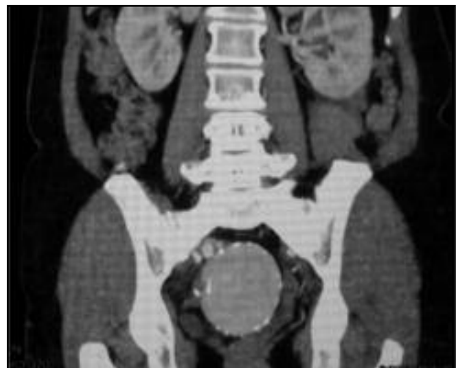
Fig. 1: CT angio of the abdomen reveals the right internal iliac.

Isolated internal iliac pseudo aneurysms are rare and accounts to about 0.4% of all intra abdominal aneurysms, but their