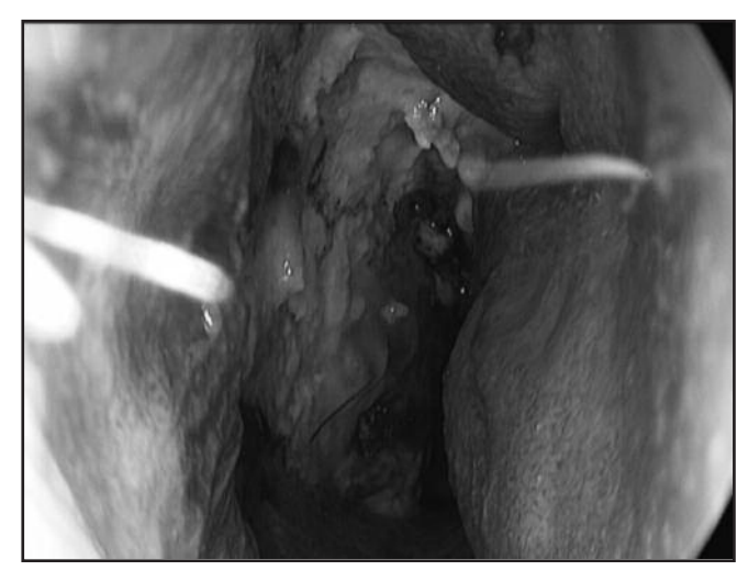
Fig. 1: Pre-operative endonasal endoscopic view revealed extensive crusting with polypoidal tissue and slough of the right lateral nasal wall.