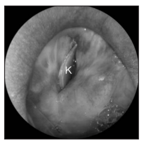
Fig. 3: shows a secured custom-fashioned silastic sheet keel (K) straddling raw free margins of the true vocal folds.

Fig. 1: shows confluent glottic web/fusion with a pinhole opening (repeat end-arrow), posterior glottis scar, and supraglottic submucosal scar (arrow head-ball). [Aanterior commissure, P- posterior commissure, T- true vocal cords].