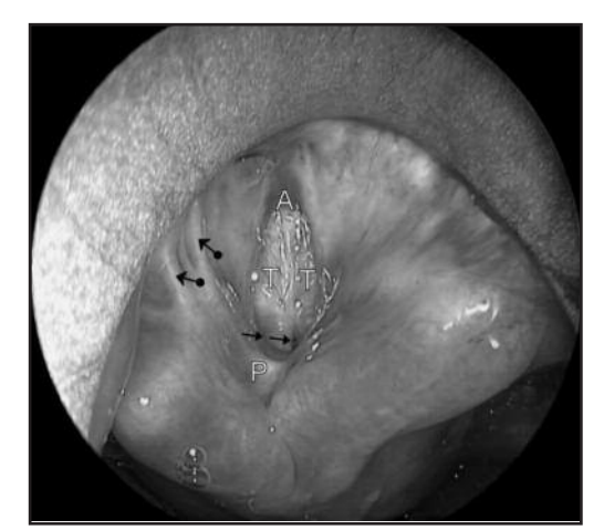
Fig. 1: shows confluent glottic web/fusion with a pinhole opening (repeat end-arrow), posterior glottis scar, and supraglottic submucosal scar (arrow head-ball). [Aanterior commissure, P- posterior commissure, T- true vocal cords].