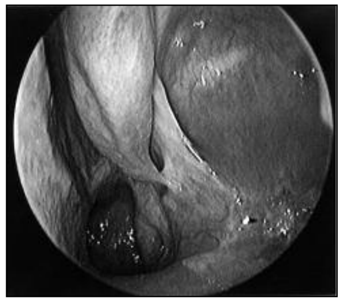
Fig. 2: Post-Operative tumor surveillance. The left maxillary sinus can thoroughly be inspected with a 70 degree endoscope after a medical maxillectomy

The three principal aims of sinonasal tumor excision is firstly, to create adequate and sufficient exposure for complete resection, secondly, to provide an unobstructed view for postoperative surveillance of the cavity, and thirdly, minimize cosmetic deformities and functional disabilities. Endoscopic excision achieves all these objectives. Inverted papilloma often demonstrates aggressive local invasion with high recurrence rates if incompletely excised, as well as a potential for harboring squamous cell carcinoma<sup>2</sup> Therefore, it is imperative that these lesions be treated aggressively as one would in a similar case of squamous cell carcinoma.