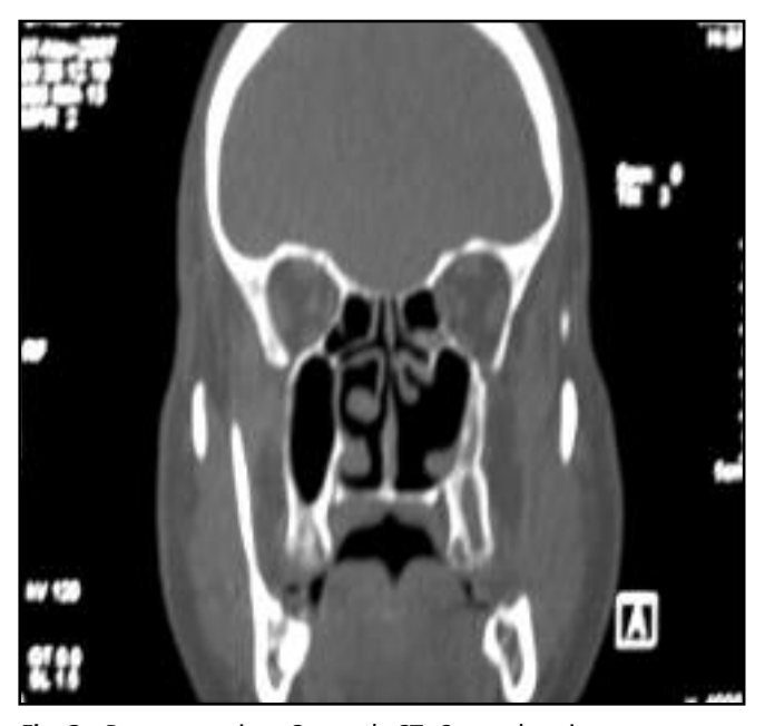
Fig. 3: Post-operative Coronal CT Scan showing no tumor recurrence and a complete (L) medial maxillectomy done