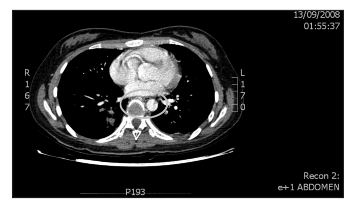
Fig. 2b: New filling defects noted in the left subsegmetal pulmonary arteries on a later CT scan.

hyperaemic optic discs. CT scan of the brain was normal, giving an impression of a transient ischaemic attack. A brain MR angiogram was also normal, with no evidence of intracranial vasculitis.