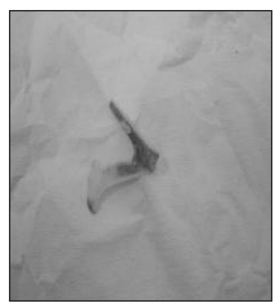
Fig. 2: Fish bone after removal