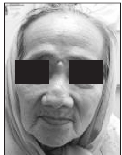
Fig. 1c: On 2-month follow-up, wound healed with minimal scar

This article was accepted: 27 August 2008