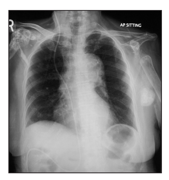
Fig. 3: Frontal chest radiograph shows the dislocated and sclerotic left humeral head located at the lateral aspect of the left rib cage in the region of the left upper breast. The ventriculoperiteonal shunt was previously placed for tuberculous meningitis.