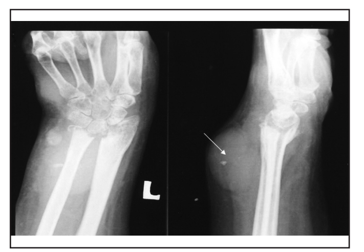
Fig. 1: Radiographs of the left wrist showed severe osteopenia, erosions and destructions of the carpal bones and radiocarpal joint. There was a large soft tissue mass on the distal aspect of the dorsal forearm with small distinct amophous foci of calcification (arrow).