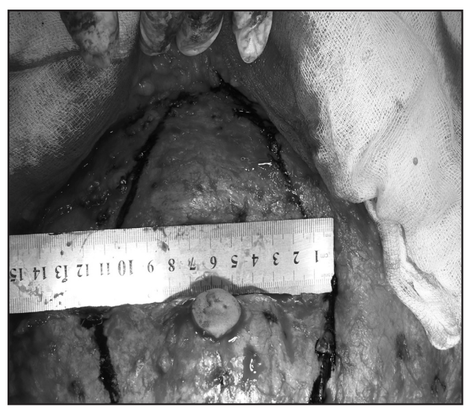
Fig. 1: Per-operative marking (Tummy tuck operation with plication of the musculo-aponeurotic layer)