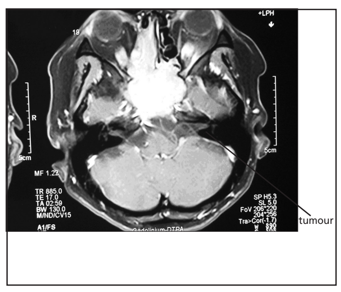
Fig. 2: MRI axial view

type<sup>s</sup>. The variable recurrence rates might be the result of an incomplete removal of the tumour partly because of the complex anatomy of the nasal cavity and paranasal sinuses4. With the advances in endoscopic equipment and techniques,