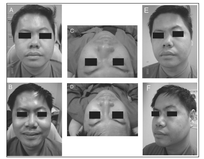
Fig. 3: A, C, E, Preoperative view of a 35-year old Chinese patient with a congenital non-traumatic twisted nose. B, D, F, Postoperative views after surgery (Medpore spreader graft was used).

(Note: Consent have already been obtained from all patients)