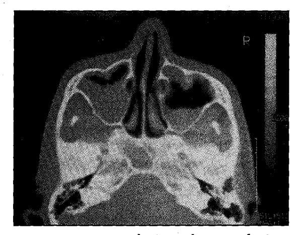
Fig 1: CT scan axial view shows soft tissue opacity of both maxillary sinuses.