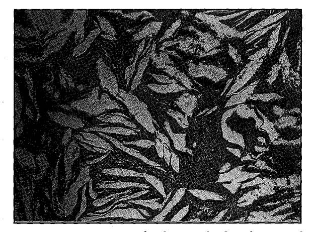
Fig 3: Microscopic finding of the biopsied tissue of maxillary sinus showing foci of cholesterol granuloma accompanied by foreign body giant cells and focal areas show fibrosis, hemosiderinladen macrophages and granulation tissue.