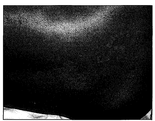
Fig 2: Cutanious lesion in the distribution of spinal AVM i.e. C7 until T6.