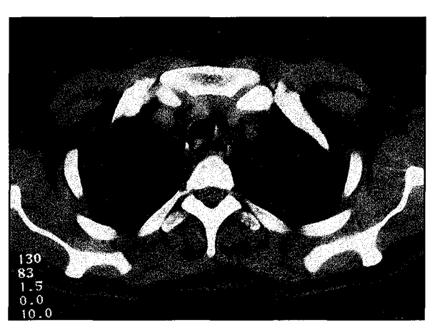
Fig 2: CT scan showing the frank fistulous tract between the trachea and the esophagus.