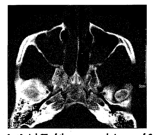
Fig. 4: Axial CT of the paranasal sinuses of Case 2 shows a soft tissue mass completely filling the right nasal cavity and causing compression/displacement of the medial wall of the right ethmoid sinus and the nasal septum.