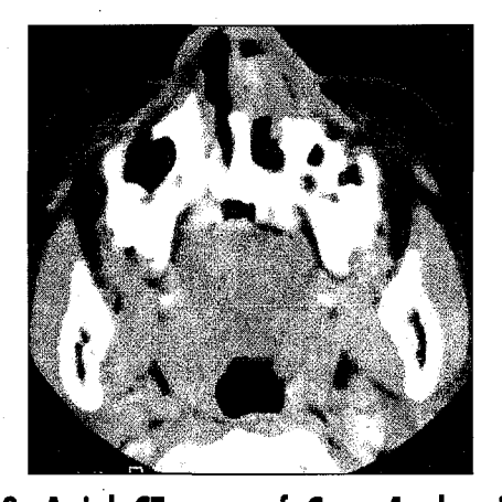
Fig. 3: Axial CT scan of Case 1 showing a localized tumor arising from the septum and obstructing the nasal cavity.

Fig. 1: (Case 2) shows a cellular tumor, arranged in a whorling pattern, consisting of monotonous cells and indistinct eosinophilic cytoplasm. Mitotic activity is generally absent. Blood vessels range from small capillary-sized vessels to sinusoidal spaces with little intervening collagen.