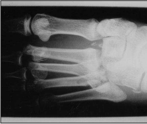
Fig 1: Bony tarsometatarsal joint injury at time of presentation