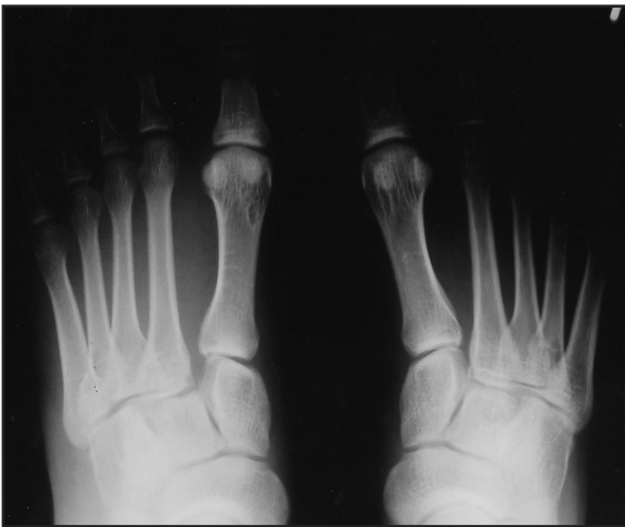
Fig 3: Subtle diastasis widening can be detected in the antero-posterior weight bearing comparison film