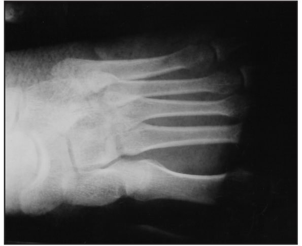
Fig 2: Ligamentous tarsometatarsal joint injury presented as a symptomatic foot with no obvious x-ray findings in non weight bearing films