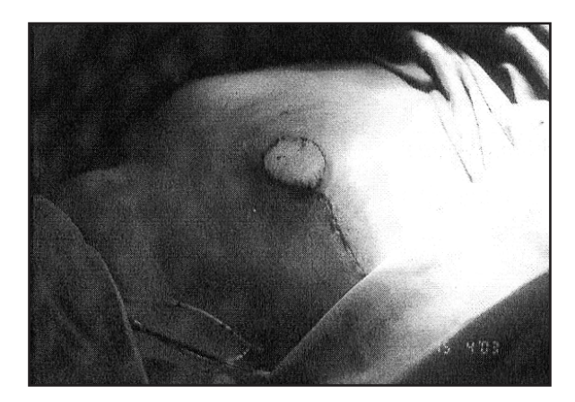
Fig. 1: Periareolar incision with lateral extension : SSM Carlson's Type I