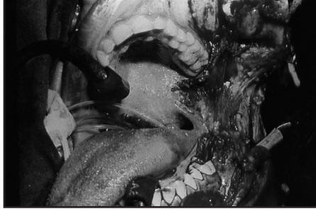
Fig. 3: Transcervical approach with mandibulotomy showing the parapharyngeal space post tumour removal