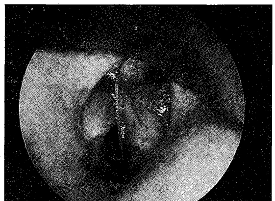
Fig. 1: Endoscopic view of avulsion of anterior ends of both vocal cords at the anterior commissure

Patient underwent psychiatric treatment post-operatively. Swallowing and speech recovered. The endoscopic assessment after keel removal at 6 weeks was free of webbing or stenosis. Voice after decannulation was satisfactory.