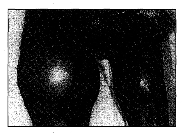
Fig 1: Swollen right knee