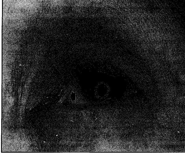
Fig. 2: Silastic tubes in place in the medial canthus