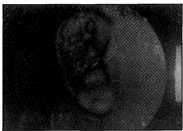
Fig. 2: The patient's right ear was grossly swollen as a result of inflammation of the underlying auricular cartilage, giving the appearance of "cauliflower ears".

A diagnosis of bilateral anterior uveitis secondary to relapsing polychondritis with secondary glaucoma was made. ESR was 75mm/1st hour. Full blood count, serum electrolytes were within normal limits. Anti-DNA antibody was negative. Rheumatoid factor was <20iu/ml. The C3 was 203mg/dL (normal range 83 - 177mg/dL) and C4 was 71mg/dL (normal range: 15 - 45mg/dL). The raised ESR and complement levels support the presence of an inflammatory process.