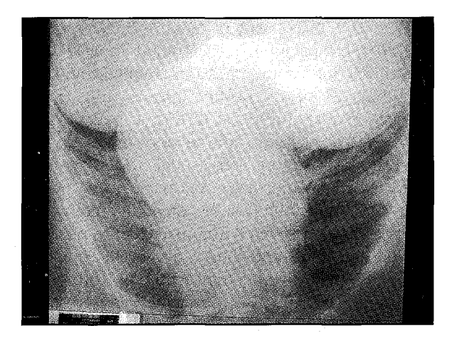
Fig. 1: Anteroposterior supine chest radiograph revealed a grossly widened mediastinum and indistinct aortic knob, indicating mediastinal haematomas.

pleural effusion. The solid organs of the abdomen were normal and there was no free fluid seen in the peritoneal cavity.