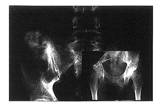
Fig. 1: Pelvic tumour before resection and (inset) post resection of tumour with fibular autograft as strut with mobile hip (case 1).

A twenty-seven year old gentleman presented with right thigh pain for 20 months, which was relieved by massage and non-steroidal anti-