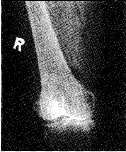
Figure 1: AP radiograph of the right knee with the air-fluid levels (shown with dark arrows). Note the subcutaneous air along the medial and thigh.