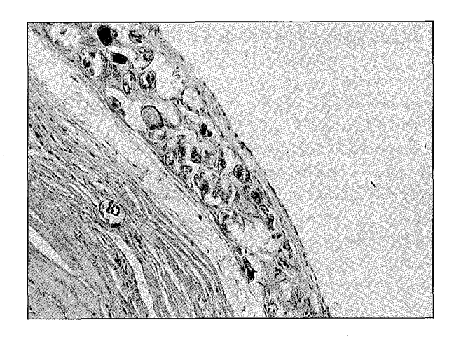
Fig. 2: Scarring granuloma with the egg in the nidus in fibrotic cyst wall. H &E x 200