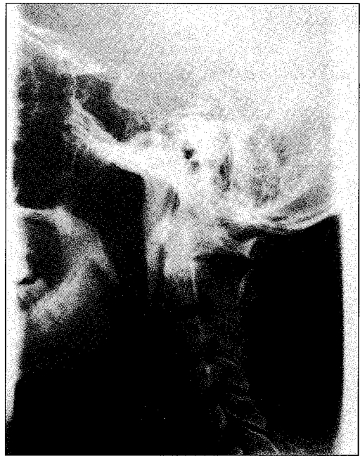
Fig. 2: Lateral view of cervical spine (postoperative).

Under general anaesthesia, a transverse incision over left side of neck was made. The trachea and the oesophagus were retracted medially, and the carotid sheath retracted laterally to expose the osteophytes which were then removed. Post operative period was uneventful. On the 5th day, patient was able to take semisolid food. On follow up she was able to enjoy the solid food without any discomfort. Postoperative x-ray showed there was no osteophytes (Figure 2). The patient was followed up for a period of six months with no further recurrence of symptoms.