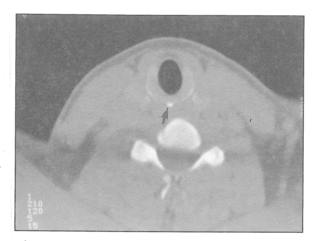
Fig. 2: Axial image at the level of the cricoid (bone settings) showing a dense opacity (arrow) lying just posterior to the cricoid

Even though plain films (lateral view of the neck) play an important role in diagnosis of these foreign bodies, the presence of calcification of thyroid, cricoid, etc. may be misdiagnosed as foreign bodies. An ossified or calcified thyroid cartilage especially if it is an isolated curvilinear, irregular or indefinite (hazy) calcification at