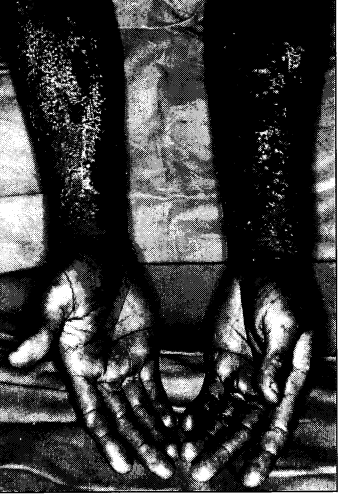
Fig. 2: Grouped erythematous papules and vesicles on the upper limbs of the patient with Herpes Gestationis