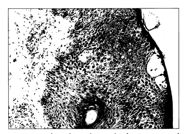
Fig. 4: Subepidermal vesicle formation and edema of dermal papilla in Herpes Gestationis with infiltrates of eosinophils, histiocytes and lymphocytes