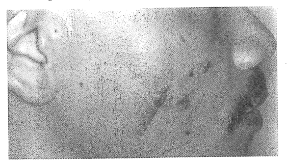
Fig. 2 : Typical lesions of Paederus Dermatitis, with a necrotic appearance on the face.

The skin lesions disappear in about two weeks but residual hyperpigmentation may persist for a few weeks and become a cosmetic problem especially when it occurs on the faces of women. Itching, tingling and pain are the chief complaints of many patients. However, the disorder may be asymptomatic. Involvement of the eye can occur presenting as conjunctivitis or keratoconjunctivitis<sup>4</sup>. When there is extensive involvement of the skin, patients may have associated fever, neuralgia, arthralgia and vomiting with erythema persisting for many months. Disorders that should be considered in the differential diagnosis include creeping eruption, dermatitis herpetiformis, erysipelas, herpes simplex, trichinosis, dermatitis atrefacta, urticating caterpillar dermatitis and phytophotodermatitis.