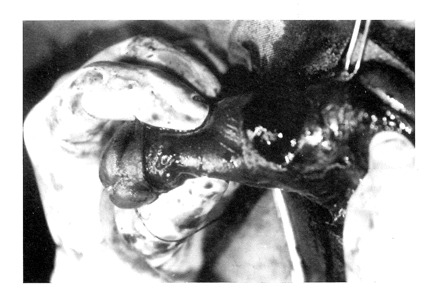
Fig 1: Shows the haematoma over the site of fracture after degloving the penile skin.