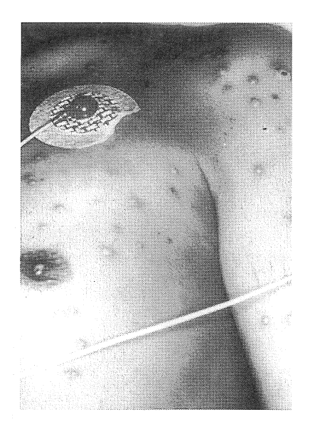
Fig 2: Multiple skin pustules.

Intravenous ceftazidime and cotrimoxazole was administered for a total duration of 14 days. By this time, the chest radiograph revealed almost complete resolution of the lung infiltrates and the skin lesions had all dried up. Orally-administered cotrimoxazole at 1920 mg bd and chloramphenicol at 500 mg qds was continued for a further 2 weeks. Subsequently, cotrimoxazole alone at 1920 mg bd was continued for another 2 months. He remained well at the time of writing this letter.