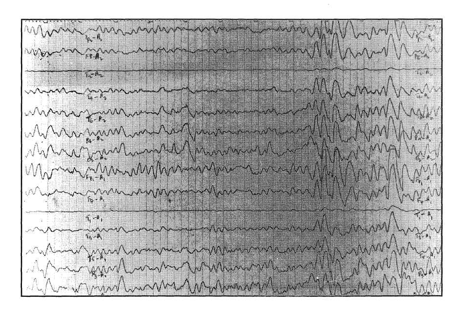
Fig 1: A normal EEG.