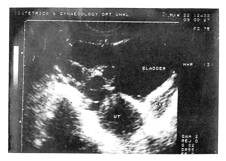
Fig. 2 A much diminished hyperstimulated ovary after the acute phase ( Case 2 ) F- Follicle Ut - Uterus Cx - Cervix