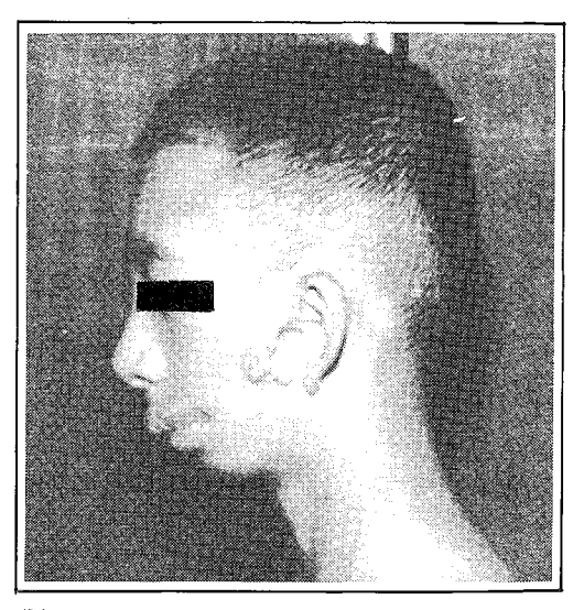
(b): Supernumerary ear tags micrognathia.