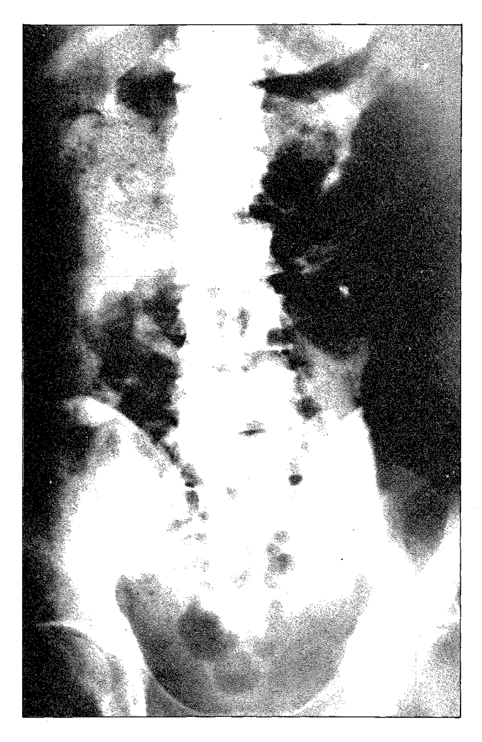
Figure 1: Supine AXR. Vague soft tlssue shadow discernible at the right lower quadrant of abdomen.

It was egg shaped measuring 20 \times 16 \times 16 cm in size and contained foul smelling liquid. The mass appeared to have arisen from the medial aspect of the caecum in the region of the appendix and had apparently eroded its way through the mesentery. It had a very well defined capsule blood vessels running over it. The tumour was resected en masse with the caecum which was unhealthy in appeareance. An end-to-end anastomosis was performed between the terminal ileum and the ascending colon. The specimen removed weighed 1050 gm. The wall contained fibroadipose tissue with necrotic material. Histological studies showed this to be a tumour that has undergone extensive necrosis. Scattered within the tumour were surviving bundles of smooth muscle fibres. Areas of hyaline degeneration with fatty infiltration were seen. The histological diagnosis was that of a leiomyoma. In retrospect, close scrutiny of the plain supine abdominal radiograph (Fig 1) did suggest the presence of a soft tissue mass in the right lower abdomen. The fluid level at the right lower quadrant was the result of liquefaction of the necrotic centre of the myoma (Fig 2). Patient had an uneventful recovery.