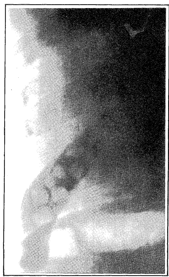
Fig. 1 Photography of plain abdominal X-ray. (The radioopaque gall bladder in X-ray appears black in photograph, with filling defects in it due to the stones.)

surface of the stones was covered with greyish white material while the core was more blackish.